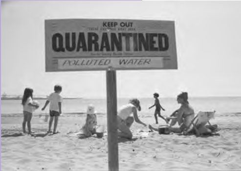
"Quarantined...Polluted Water" sign with children playing in the sand behind it on Cabrillo Beach, 1973