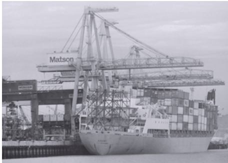
Cranes loading freight containers onto the cargo ship Kauai in the Port of Los Angeles, 1986