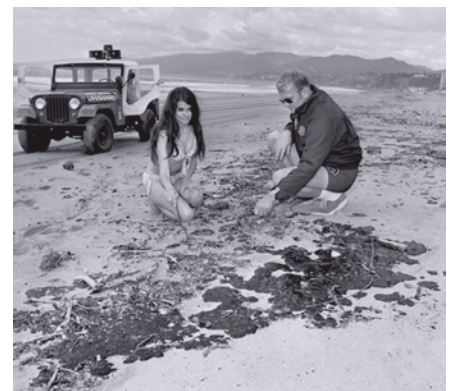
Lifeguard and woman inspecting an oil-covered beach in Santa Monica, 1969